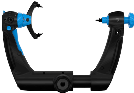
Skull Clamp Item no. 1101.001