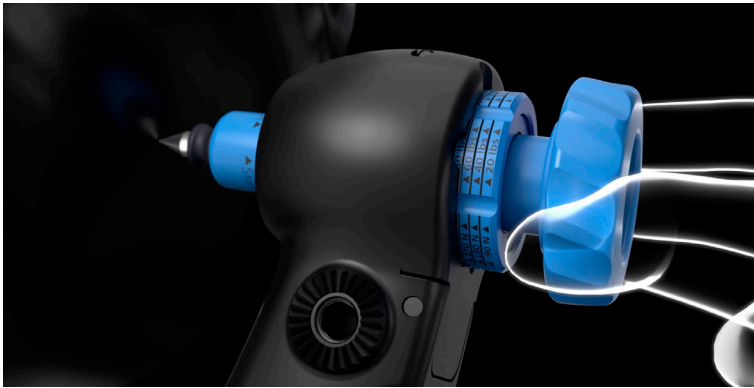
Integrated Pin Force Indication