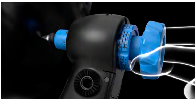
Integrated Pin Force Indication