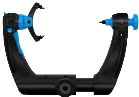
Skull Clamp Item no. 1101.001